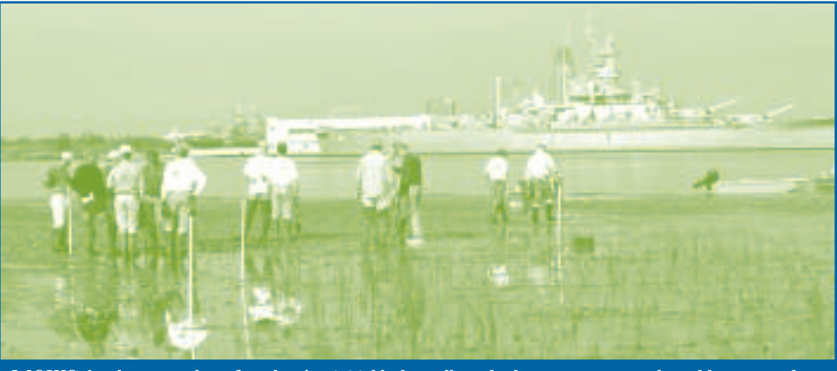
MCWCA volunteers relax after planting 700 black needle rush plants on an exposed sand bar across the Tensaw River from the Battleship on Saturday, November 10.

MCWCA members have noted the lack of marsh vegetation on this large mud flat which is exposed at low tide and visible from the Causeway. The site was selected by Marl Cummings, III of MCWCA; David Yeager and Kara Lankford of the MBNEP; and Roach as a likely candidate for the establishment of a salt marsh. The