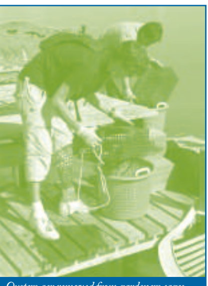
Oysters aer removed from gardeners cages prior to release on November 13.

MBNEP's Kara Lankford oversees the program and directs the volunteer gardeners - who own waterfront docks around the bay - through the process. In a "normal" year, discarded oyster shells are "bagged" in late winter months. To capture settling oyster larvae, called "spat", half of the mesh bags are placed on Cedar Point Reef and the other half in tanks at the Auburn Shellfish Lab hatchery on Dauphin Island. When bags are recovered two weeks to a month later, the shells contain "spat sets", usually consisting of five to ten attached young oysters about the size of a fingernail. In early June, Kara and partners from the Auburn University Marine Extension and Research Center (AUMERC) deliver two of the bags to each