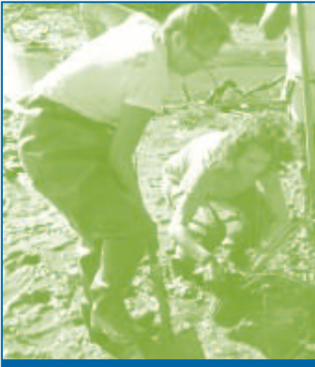
Baker High School students work together to plant black needle rush on a shoreline east of Brookley Field.