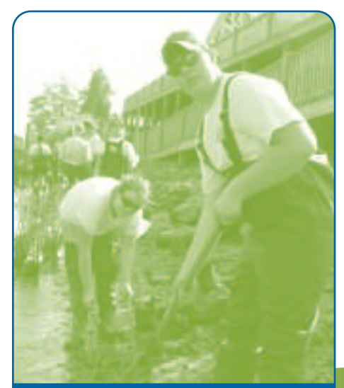
Daphne High School students planting wetland plants at Five Rivers Delta Center.

grown. Since 2005, over 1,000 students have participated in the BCGIC Program and have planted approximately 18,000 native plants in coastal restoration projects in Baldwin County.